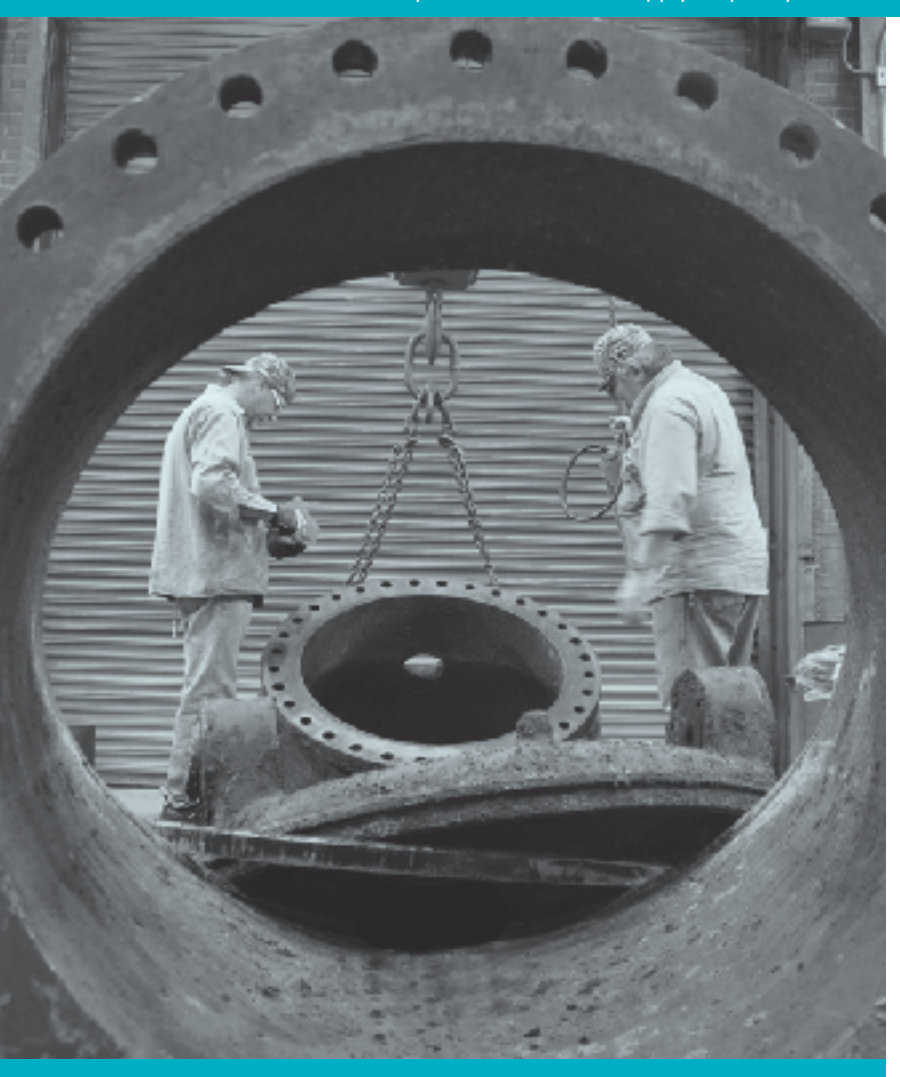
See more about this repair project on page 8

A REPORT ON THE STATE OF TAP WATER IN NEW ORLEANS The Sewerage and Water Board is pleased to provide you with this Annual Water Quality Report (also known as the Consumer Confidence Report) for the year 2012. (Este informe contiene información muy importante sobre su aqua potable. Tradúzcalo o hable con alguen que lo entirnda bien.) The Board is proud to provide the citizens of New Orleans each day with an abundant supply of quality water for personal and business needs and fire protection.